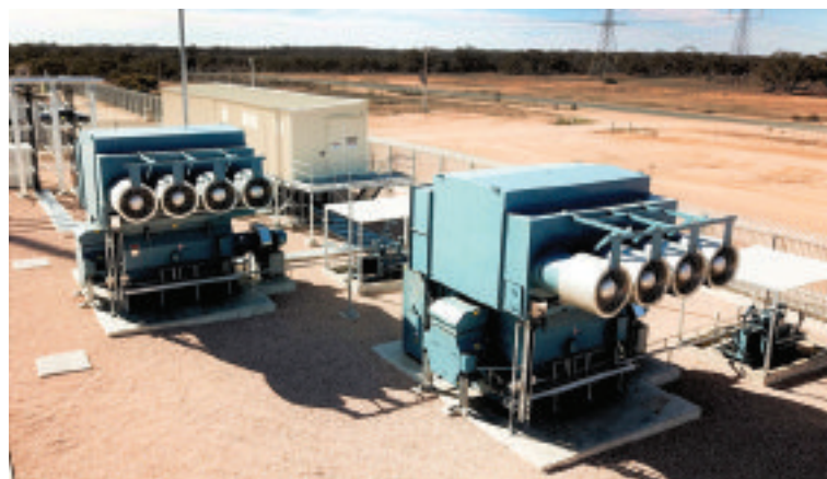
Figure 3 - Synchronous condensers installed at the Darlington Point solar farm in New South Wales, Australia.

That seems like a small number. However, as more of the traditional generation plants are decommissioned and renewables are added, SCs will become increasingly important in maintaining grid stability. SCs have already been deployed to reinforce power networks in Australia, Canada, and Scotland, and we expect that other grids around the world will be looking to this technology as the transition to greener energy continues.