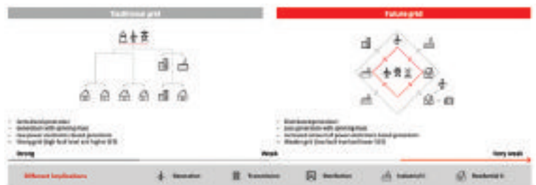
Figure 1 – power grids are becoming decentralized.

HV: The changing nature of grids, and concerns at the loss of inertia, have stimulated interest in the capability of SCs. The technology mimics the operation of large coal or gas fired generators by providing an alternative source of spinning inertia to stabilize